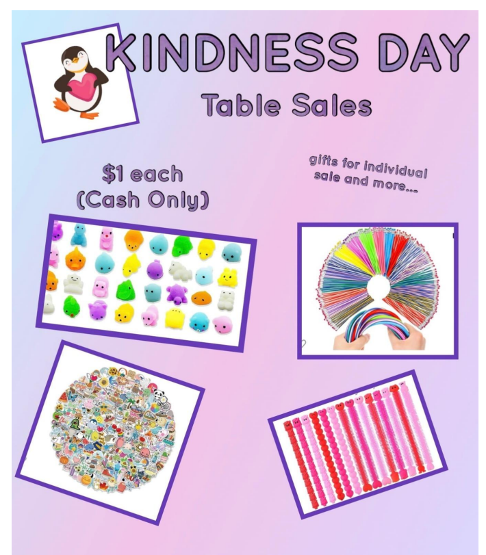
Table Sales for Kindness Day

Date: February 13 and 14 before School and During Recess